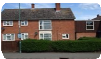
York Road, Harlescott, Shrewsbury, SY1 3RE