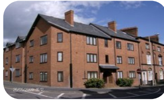
Willow Gate, Castle Street, Oswestry, SY11 1JZ