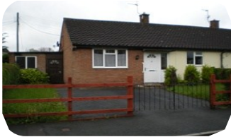
Hammonds Place, Gobowen, Oswestry, SY11 3PA