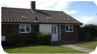
York Road, Harlescott, Shrewsbury, SY1 3QU