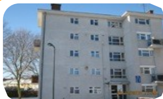
Stapleton Road, Shrewsbury, SY3 9LX