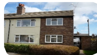
Albert Square, Weston Rhyn, Oswestry, SY10 7RT