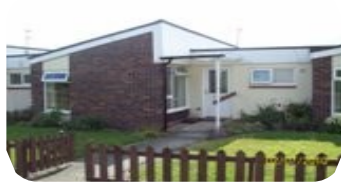
Mortimar, Harlescott, Shrewsbury, SY1 3QY