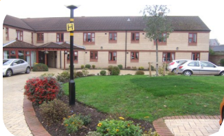
Corbet Court, Manor Garden, Market Drayton, TF9 3EE