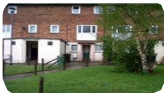
Sandpits Road, Ludlow, SY8 1HH