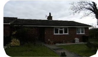
Rectory Gardens, Worthen, SY5 9JU