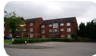
Spencer Court, Shifnal, TF11 8DP