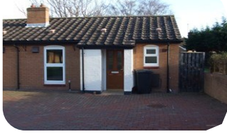
Porchfield, Shrewsbury, SY2 5YS