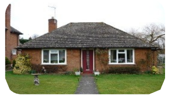
The Crescent, Badger, WV6 7JT