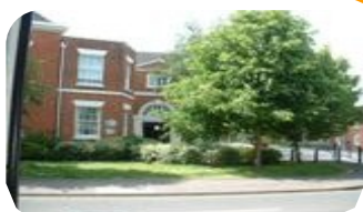
Warren Court, Market Drayton, TF9 3DF