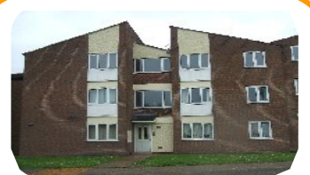
Castle Court, Whitchurch, SY13 1DE