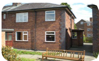
Caer Road, Oswestry, SY11 1EB