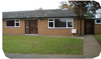
Birch Grove, Ryton XI Towns, SY4 1LH