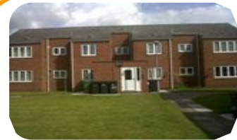
Carradine Flats, Shawbury, SY4 4NL