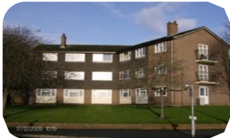
Unicorn Road, Oswestry, SY11 2DD