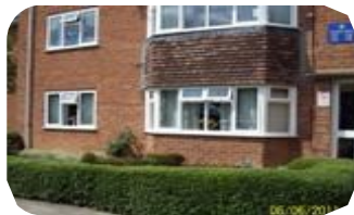
Sundorne Road, Shrewsbury, SY1 4RJ