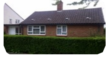
Moneybrook Way, Shrewsbury, SY3 9NW